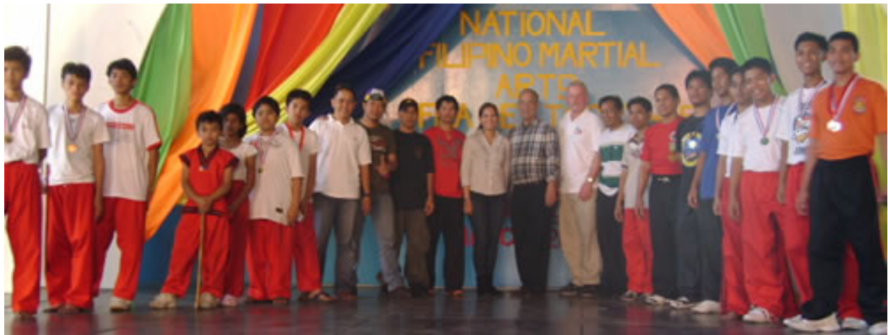
Judges, Referees, and Winners