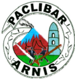
Paclibar Bicol Arnis